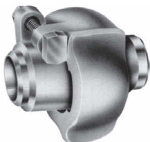
3000 lb UNIBOLT BUTT WELD STEEL COUPLING